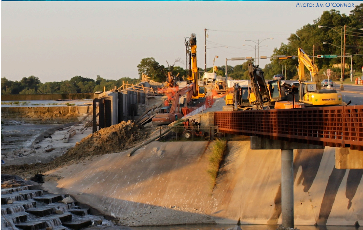
Retaining Wall Under Construction by Spillway, June 16 th 2009